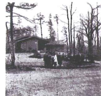
The "Hoo Hoo House" as it appeared in 1960.

Over the next few months more than 20,000 visitors came through its door, drawn by newspaper stories that bandied about words such as "experimental." In truth,