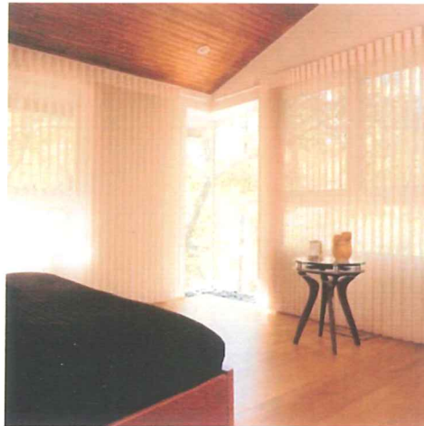
A transfigured corner in the master bedroom.