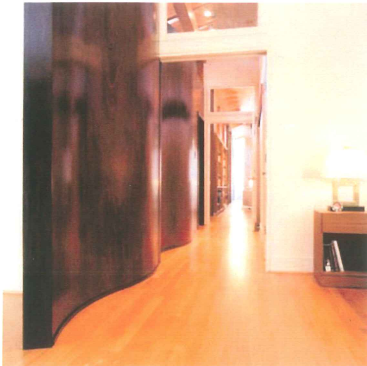
An undulating, Levinas-designed "curtain" of mahogany.